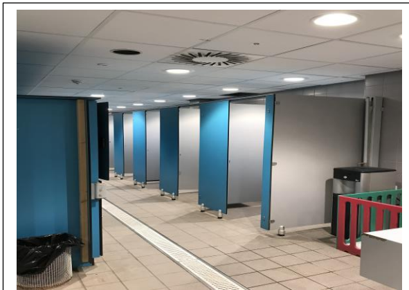
I will get dry and changed in a cubicle.