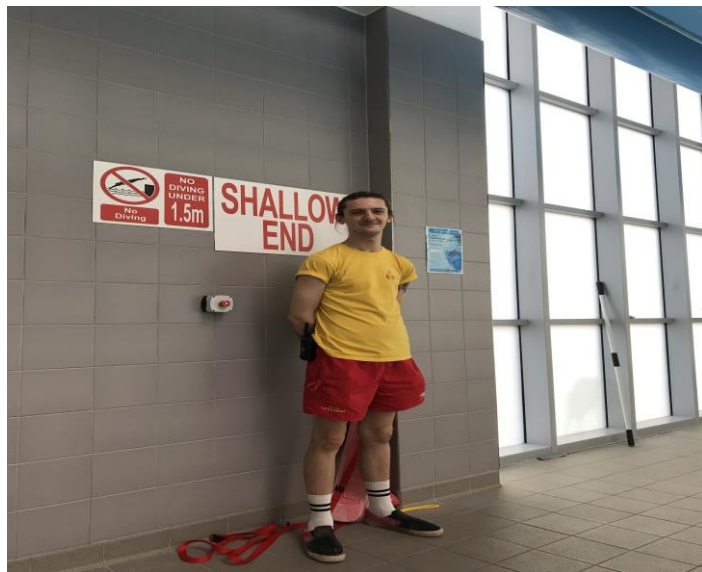
Lifeguards who can help me.