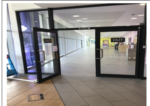
I will go along a corridor to the changing village.