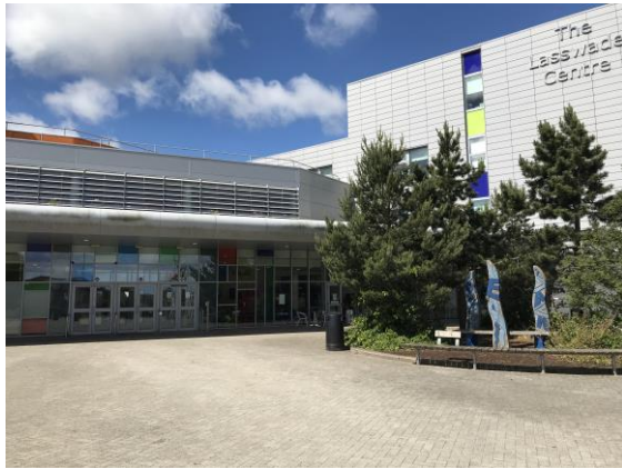
This is the way in.