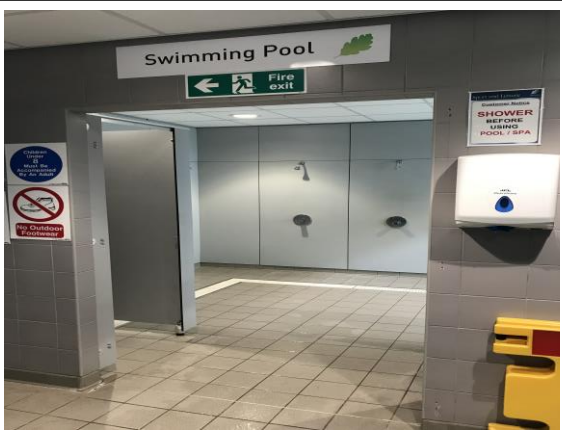
I will go this way to get to the showers.