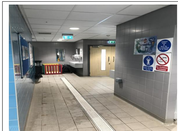
I will go this way to leave the changing village.