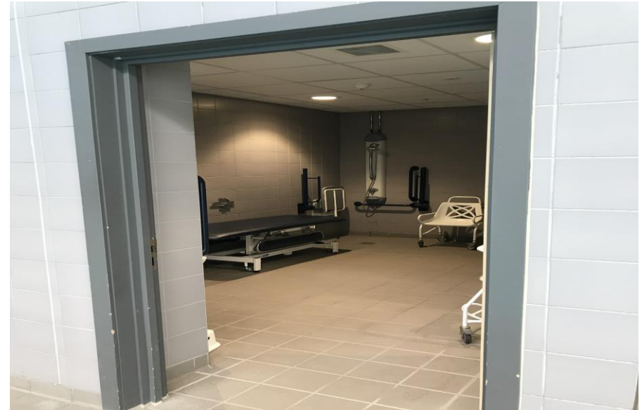
A quiet room if I need to take a break.