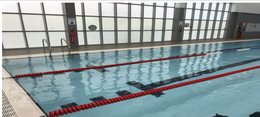
There maybe be lanes set up in the pool for people to swim up and down or the pool maybe free to swim widths.