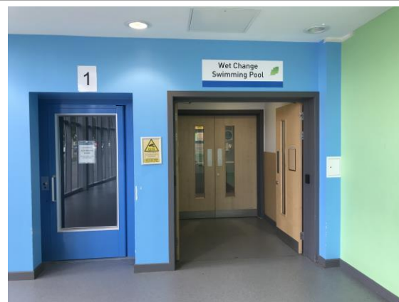
I will go this way to the changing village.