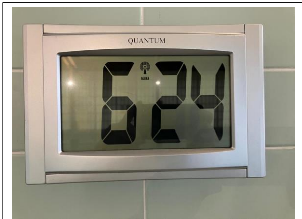
When time is up I will leave the pool.