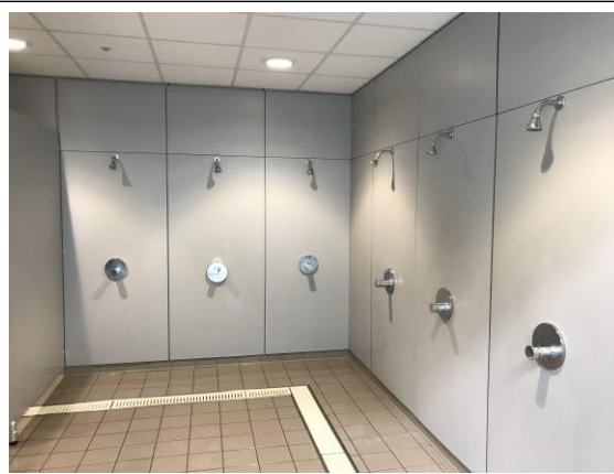
I will have a shower.