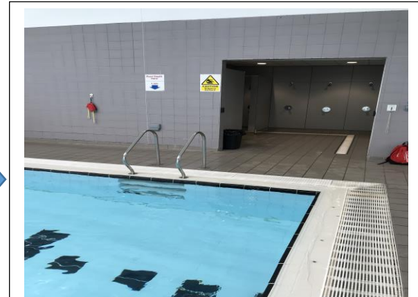
I will get in the pool.