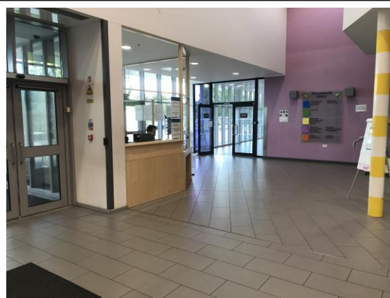
I will check in at reception.