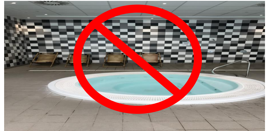
Today, I will not use the spa bath.