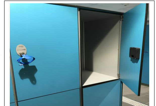
I will take my clothes and shoes out of the locker.